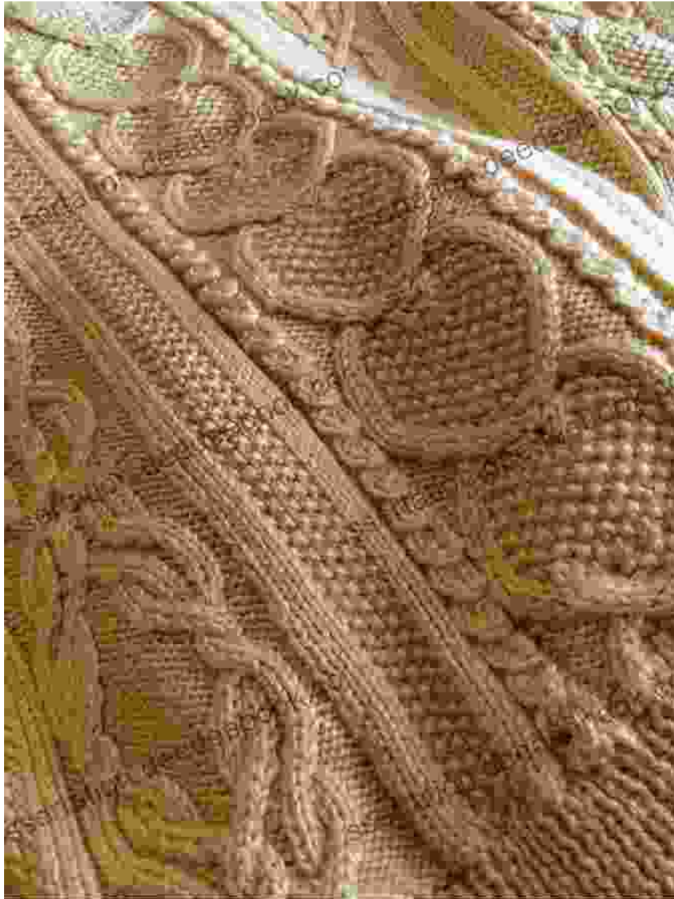
The Timeless Charm of Aran Lace Knitwear

The origins of lace cable knitting can be traced back to the 16th century in Ireland, where it was primarily used to decorate garments such as shawls, scarves, and sweaters. Over the centuries, lace cable knitting spread throughout Europe and beyond, becoming a popular choice for both formal and casual wear.