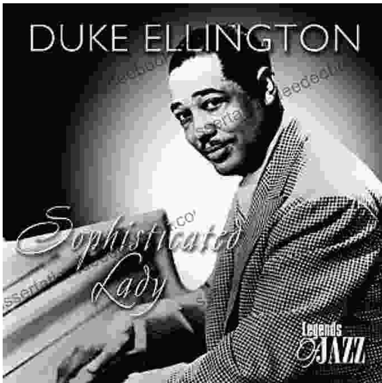
Duke Ellington performing 'Sophisticated Lady'

Written in 1933, this elegant ballad paints a picture of a sophisticated and alluring woman. The song's sophisticated melody and lush harmonies create a sense of intimacy and longing. The lyrics, written by Mitchell Parish and Irving Gordon, capture the essence of a woman who exudes grace and poise.