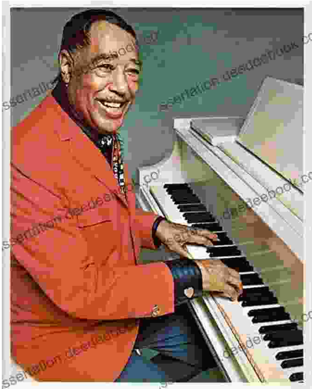
Duke Ellington singing

Duke Ellington's music continues to inspire and captivate audiences worldwide. His compositions are a testament to his exceptional talent, creativity, and passion for jazz. The ten songs explored in this article provide a glimpse into the rich and diverse legacy of one of the greatest composers of the 20th century. Whether it's the energetic swing of "It Don't