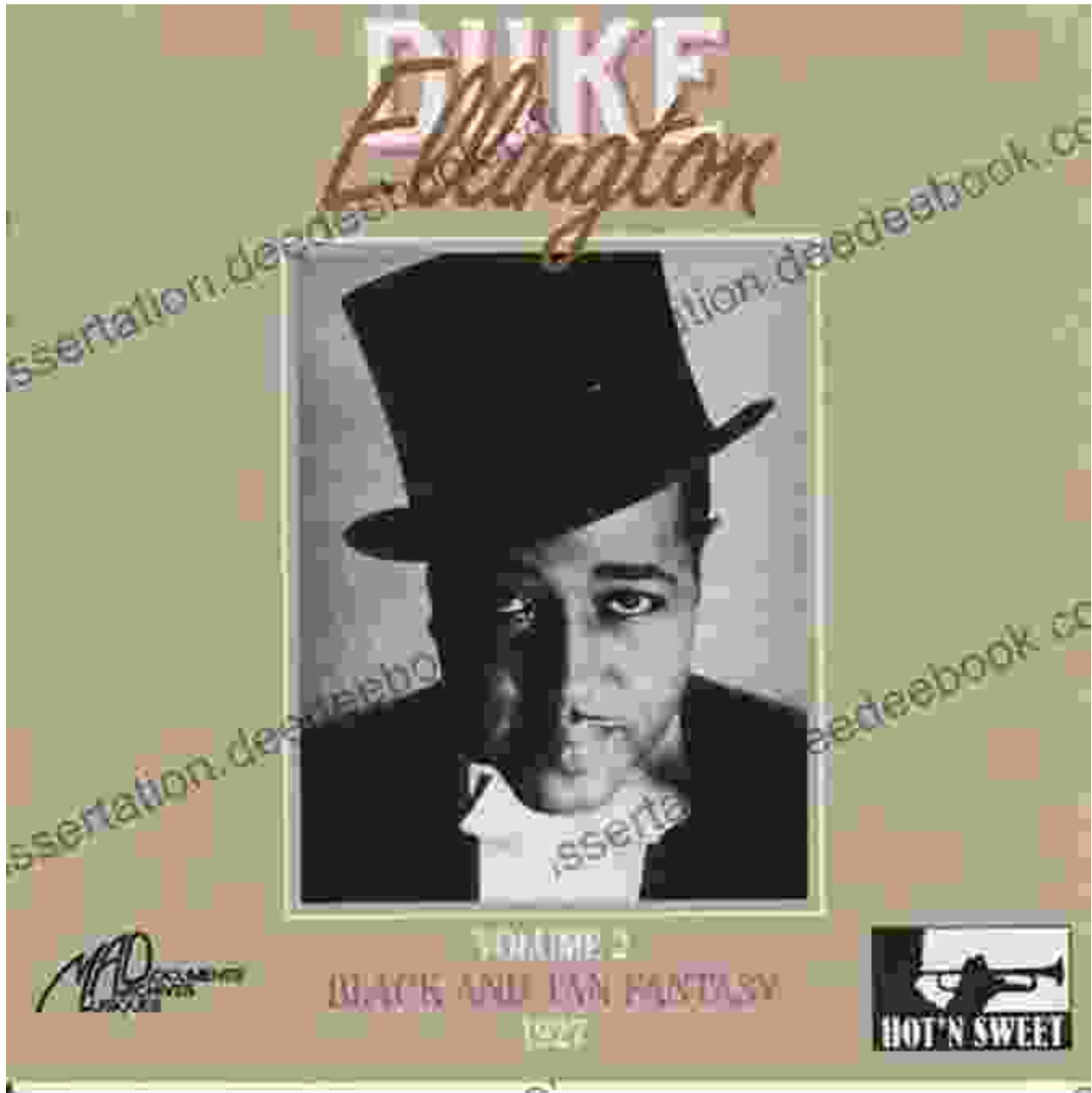
Cover art for the 'Black and Tan Fantasy' album by Duke Ellington