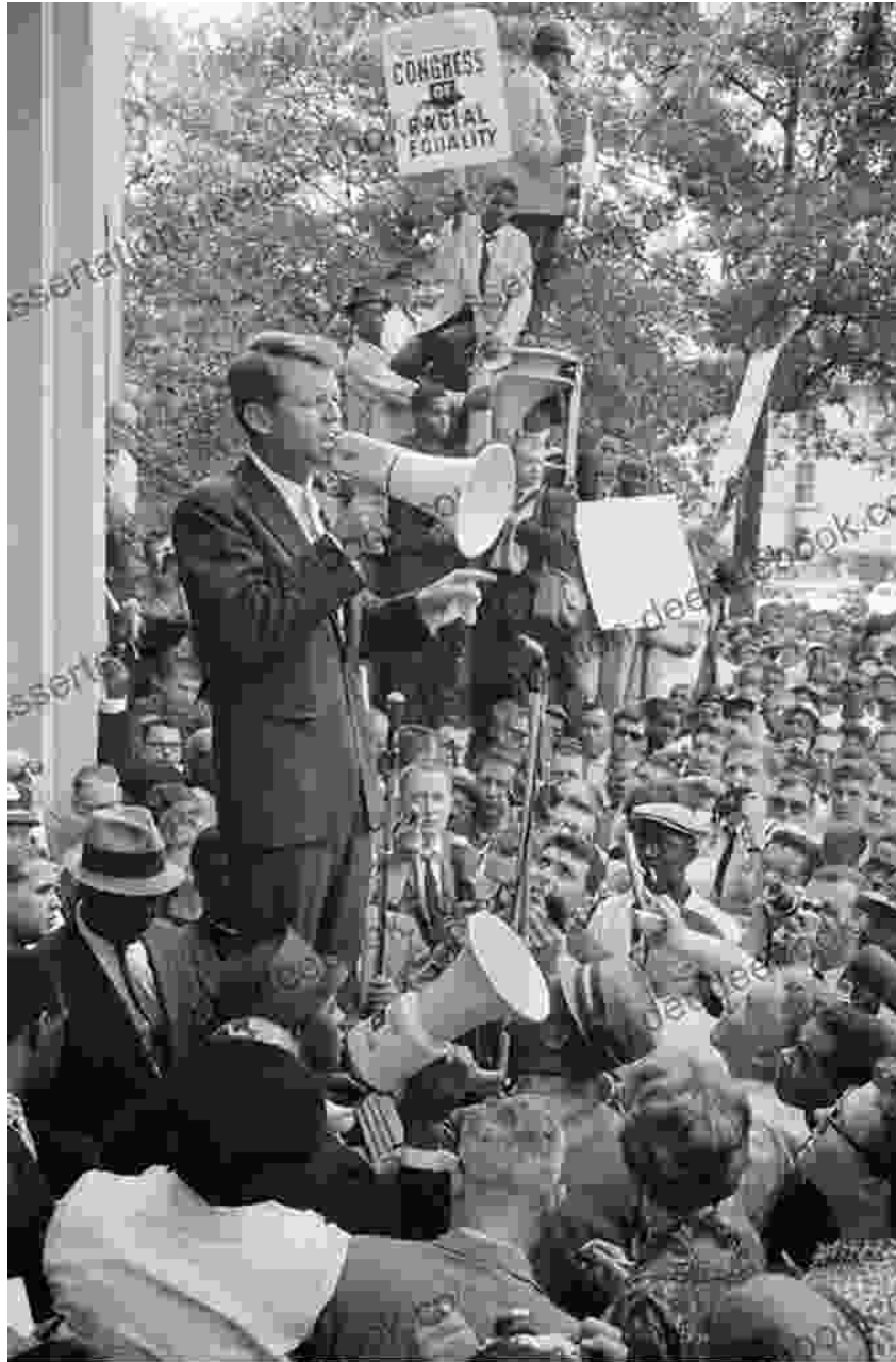
Robert Kennedy speaking at a rally in 1964.