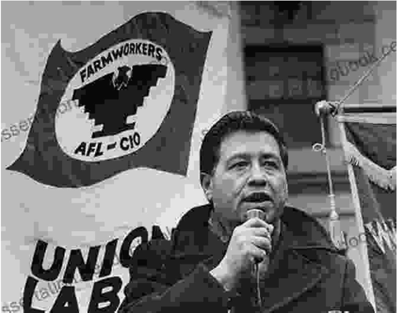
Cesar Chavez speaking at a rally in 1972.