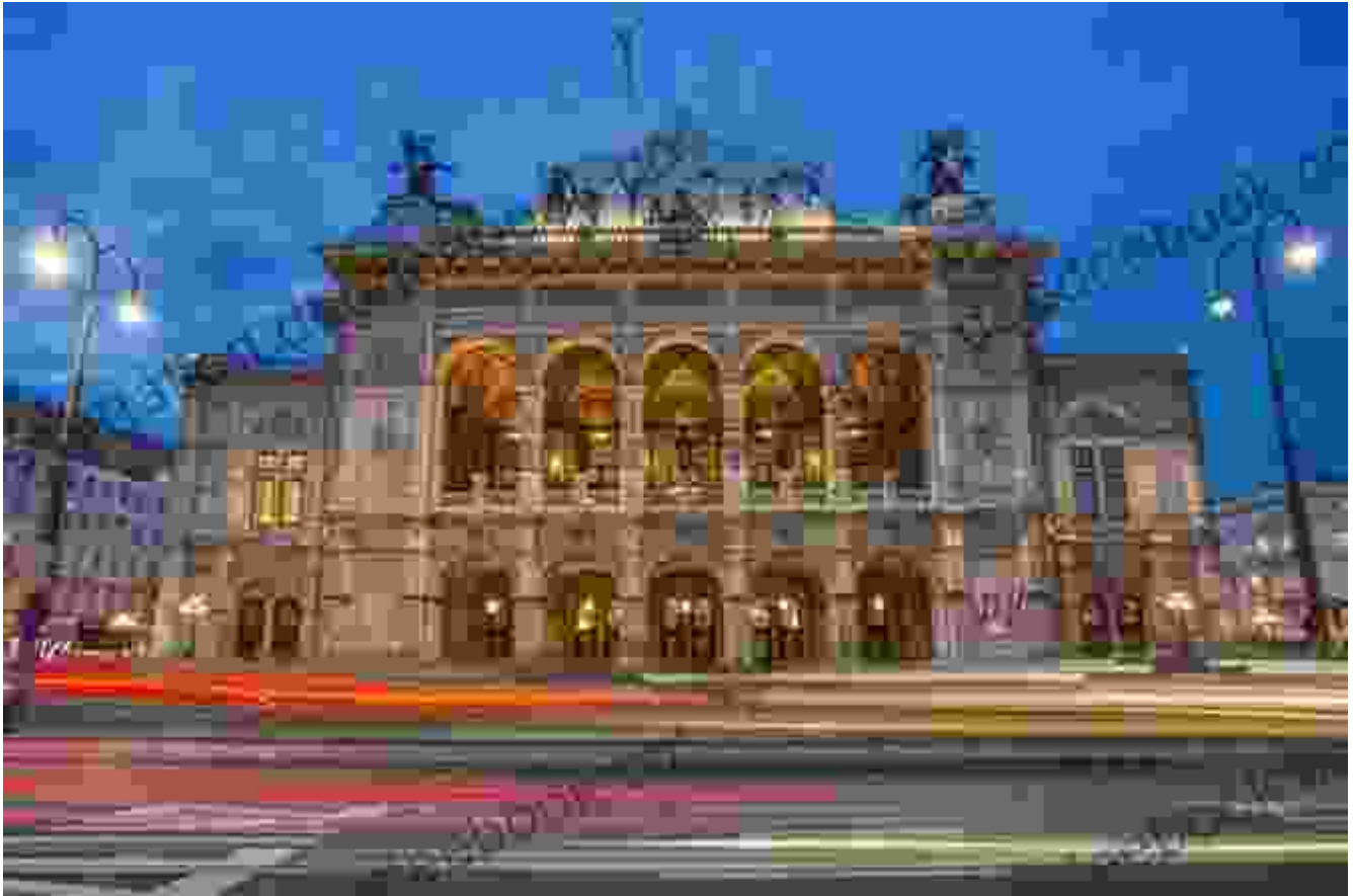
Vienna State Opera, Vienna