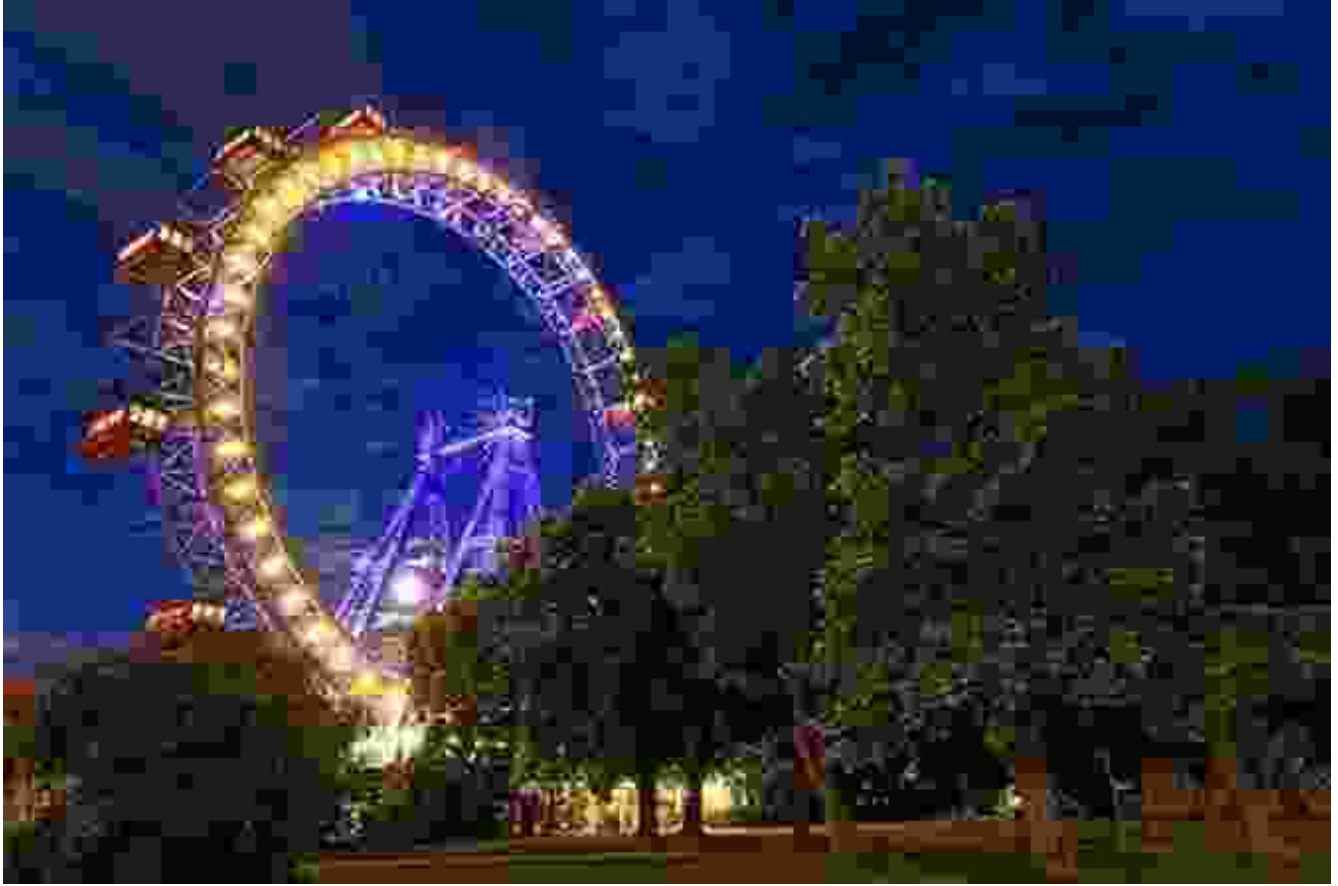
Vienna Giant Ferris Wheel, Vienna