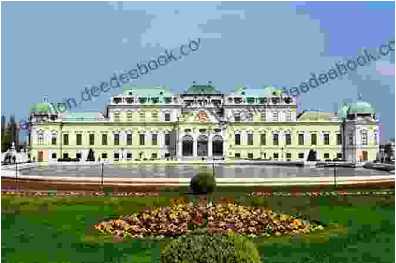
Belvedere Museum, Vienna